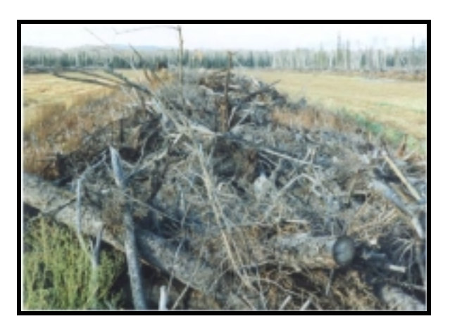
Figure B-2: Close up view of piled woody debris and vehicle for scale, land clearing (Delta Junction, Alaska).

Figure B-1: Close up View of piles woody debris from land clearing (Delta Junction, Alaska).